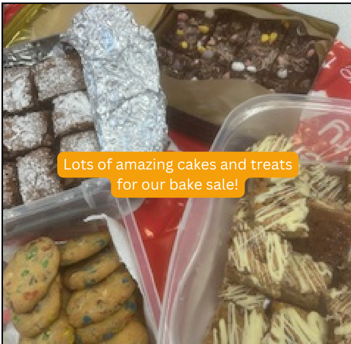
Lots of amazing cakes and treats for our bake sale!