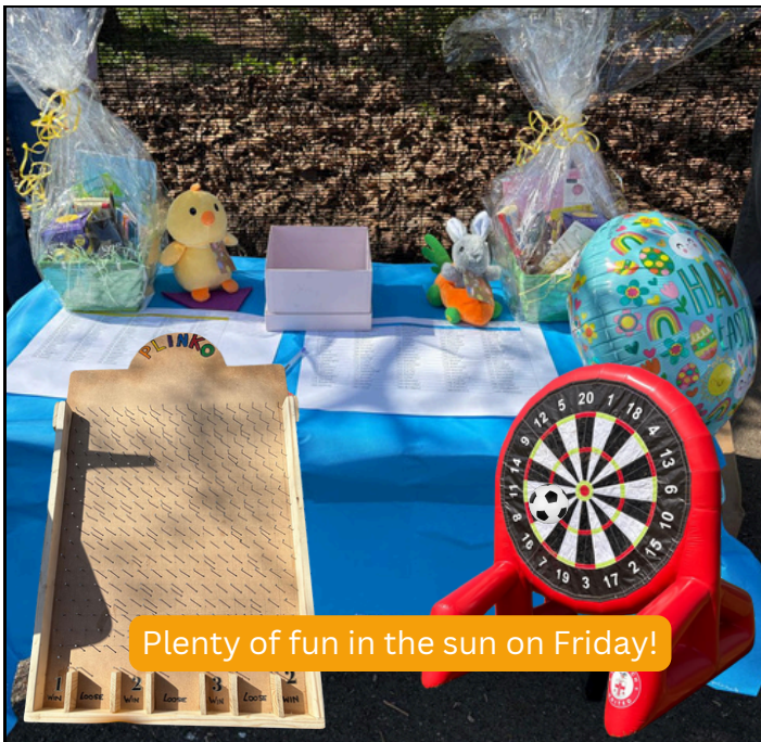
Plenty of fun in the sun on Friday!